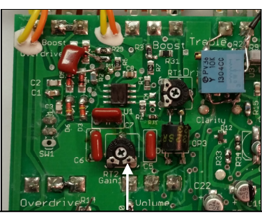
Stage 2 Drive pot: Factory Set to 50% rotation. CCW = more distortion edge CW= less distortion, clearer

www.dlseffects.com © all rights reserved 9/15/15 Specifications subject to change without notice, all rights reserved